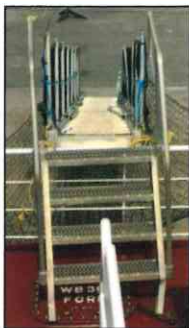
Fig. 2: Accommodation Ladder

If a gangway cannot be placed on the bulwark and must go on the hand rails, the hand rails must be verified as adequately designed and rated to handle the gangway.